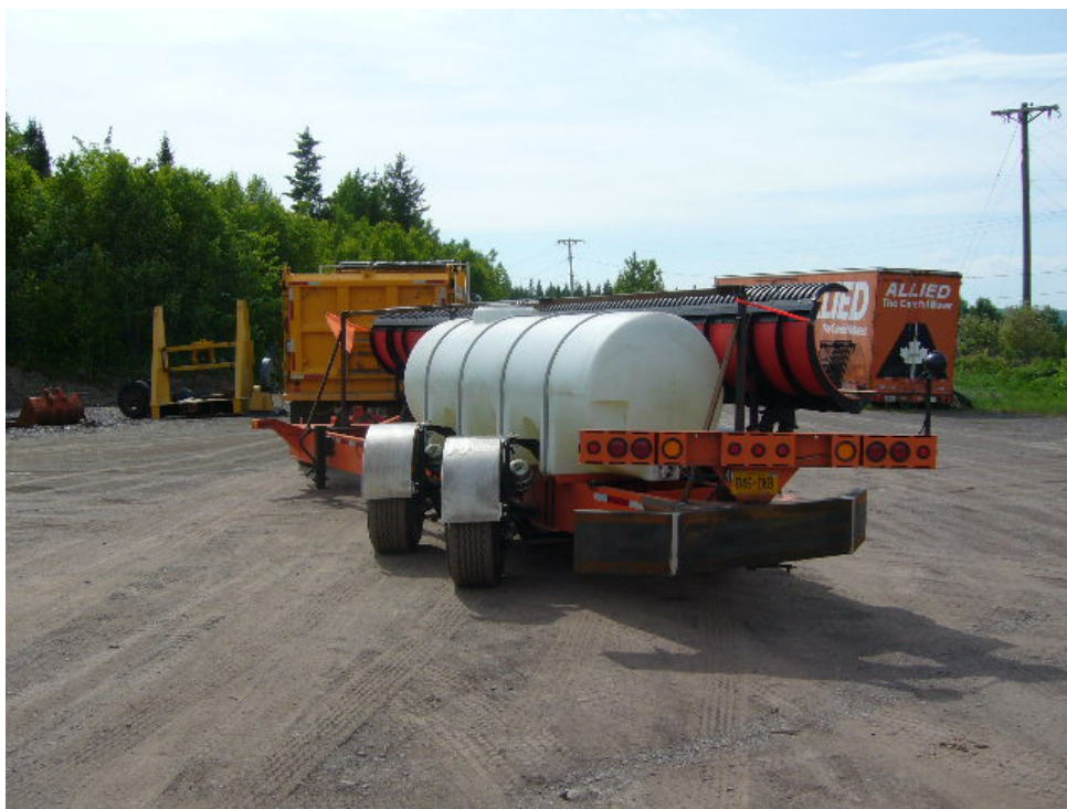
Figure 3 – Modifications including cycle fenders, chamfered bumper