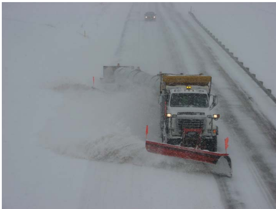
Figure 5 – At Work in Heavy Snow

Overall, the addition of the Tow Plow to the winter snow and ice control complement has provided Brun-Way with the ability to maintain and improve the level of service on the Trans Canada Highway Project. The Tow Plow has enabled Brun-Way to survive two extreme winter seasons as well. The public communications efforts have resulted in general acceptance of the Tow Plow on the highways by the road users. Brun-Way operators have embraced the Tow Plow and to operate one has become a point of pride with staff.