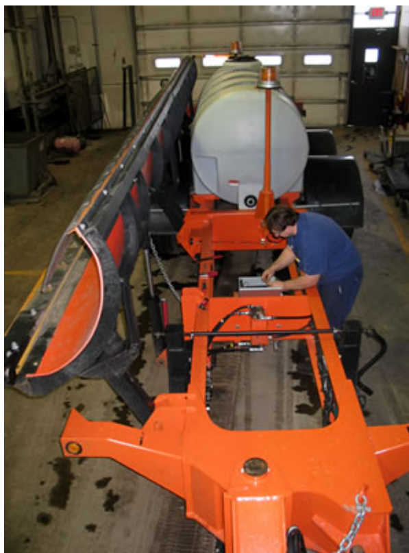
Figure 2 – Tow Plow