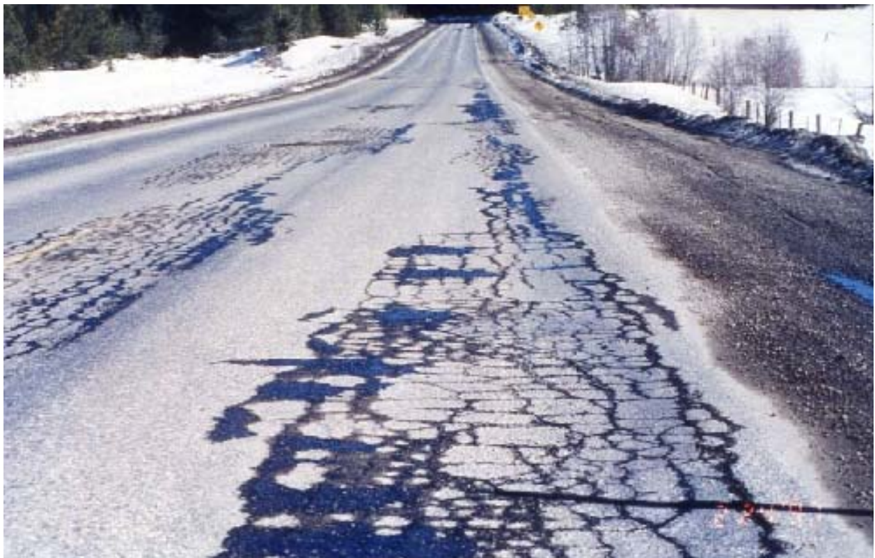
Figure 3 - Road damage caused by frost heave

The Meridian team will integrate each state’s rules of practice, policies and guidelines with the seasonal weight restriction tool so that the recommendations can be customized for each jurisdiction. The result of this integration will yield a US state-specific decision support system which will be installed within an operations facility at each partnering state agency [8].